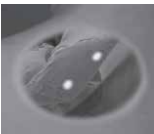
Non-contractual image - 3D modeling

Real-time autofluorescence visualization