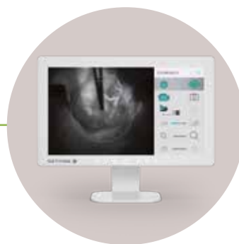
Visualize Real-time perfusion assessment