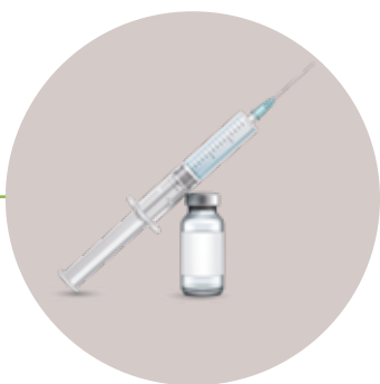
Inject Indocyanine Green (ICG)