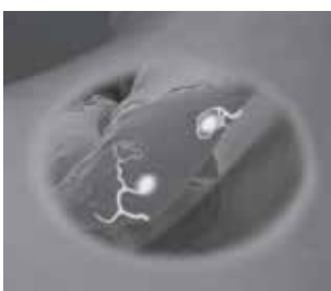
Non-contrastual image - 3D modeling